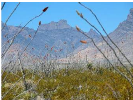
Heavy stands of ocotillo

There are heavy stands of ocotillo along much of the road. The road is a weak 2.0.