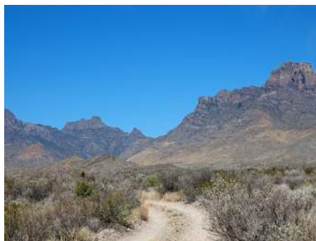
Juniper Canyon in the distance

There is a GPS - gpx track file at the bottom of the page.