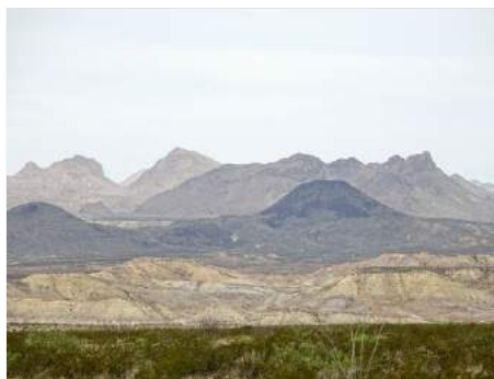
Perhaps the 'Paint' of Paint Gap?

There is a GPS - gpx track file at the bottom of the page.