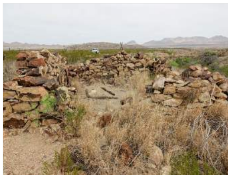
Mathews Ranch house ruins

In the wash below the ranch is a picturesque spring and green masses of ferns hanging from the canyon walls where water seeps out of the rock layers.