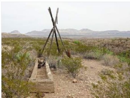
Mathews Ranch water trough

Not much remains of the early-day Mathews Ranch.