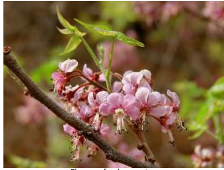
Flower of unknown tree