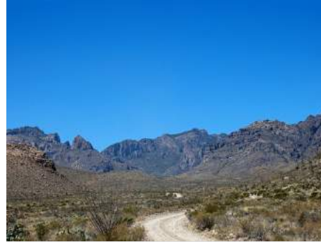
Headed for Pine Canyon

Pine Canyon has been declared a Research Natural Area and is to be left undisturbed to serve as a gauge by which to measure changes in man's natural environment. For this reason, no camping is allowed in the heart of Pine Canyon.